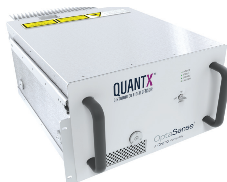
The OptaSense QuantX Distributed Fiber Sensing Interrogator Unit.

range quantitative data performance with high fidelity and sensitivity. QuantX interrogates the fibre with a sequence of launch pulses that unwrap higher fidelity phase and amplitude locked information